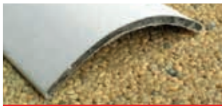
• C profile