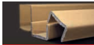
• U profile