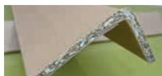
• Asymmetric wings