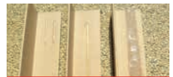
• Adhesive – different tacks