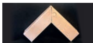
• Puzzle-type corner protection (*)