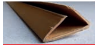
• U clip