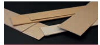
• Flat strip