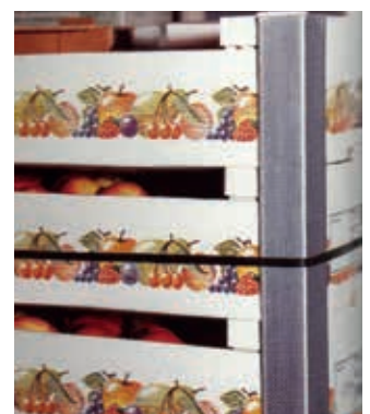
• Moisture protection